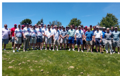
June 2019 ~ Golf Outing at Fowler's Mill Golf Course