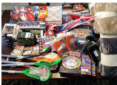
Comfort Cart items for Cleveland Clinic Adolescent & Young Adult Cancer Patients