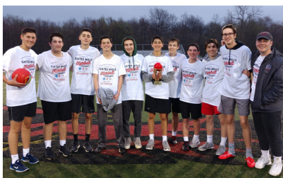
April 2019 ~ Hawken students win the "Gates Mills Kickball Classic" against Gilmour